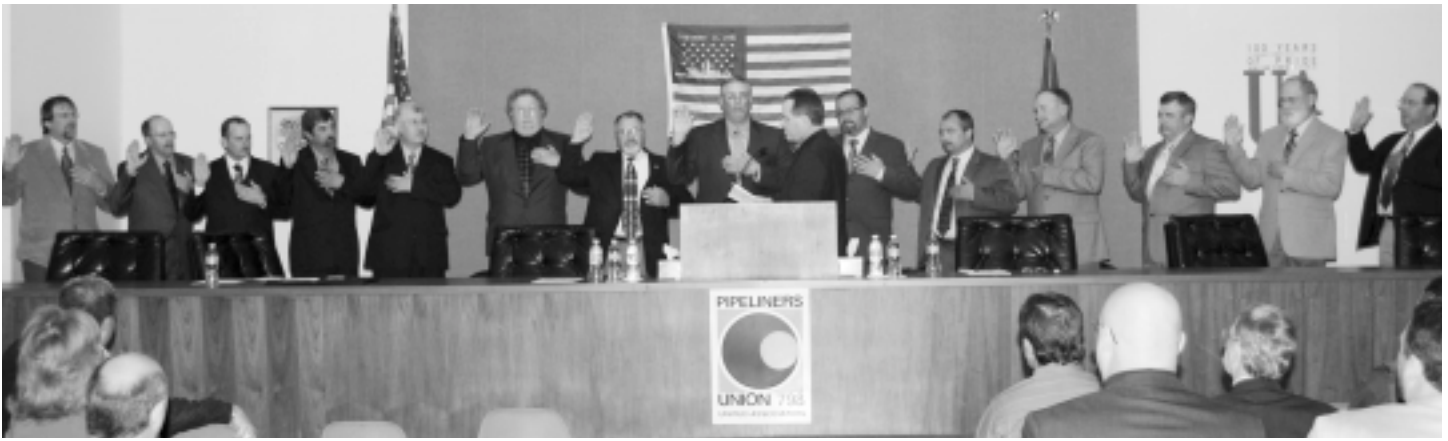
Installation of Local 798 Officers, March 7, 2008