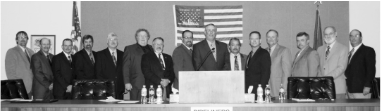
Pipeliners Local 798 Officers